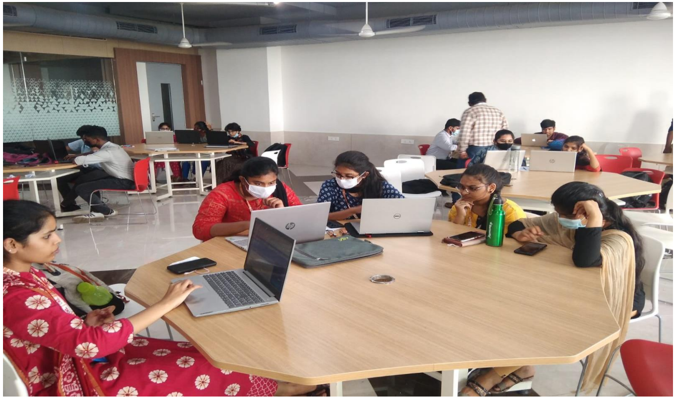
Pics: Professional society activity: The Big Bull- Finance Game on 24-03-2022