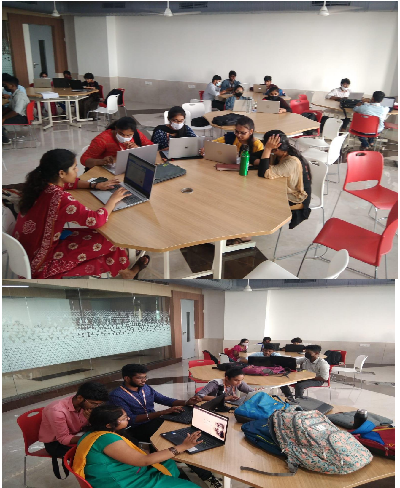
Pics: Professional society activity: The Big Bull- Finance Game on 24-03-2022