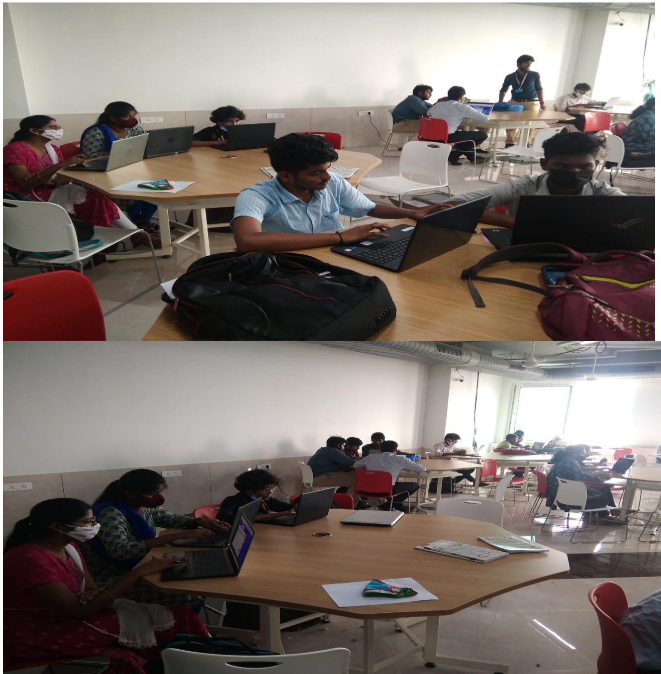
Pics: Professional society activity: The Big Bull- Finance Game on 24-03-2022